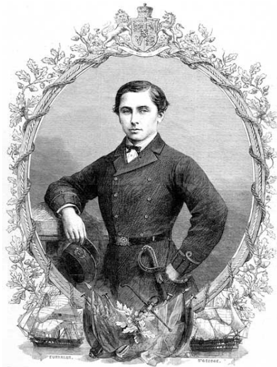
Prince Alfred 1844 – 1890

First published in Shemot in March 2006 Volume 14, No. 1, and is reprinted here with permission. This article was revised in April 2006 and includes information which did not appear in the original version