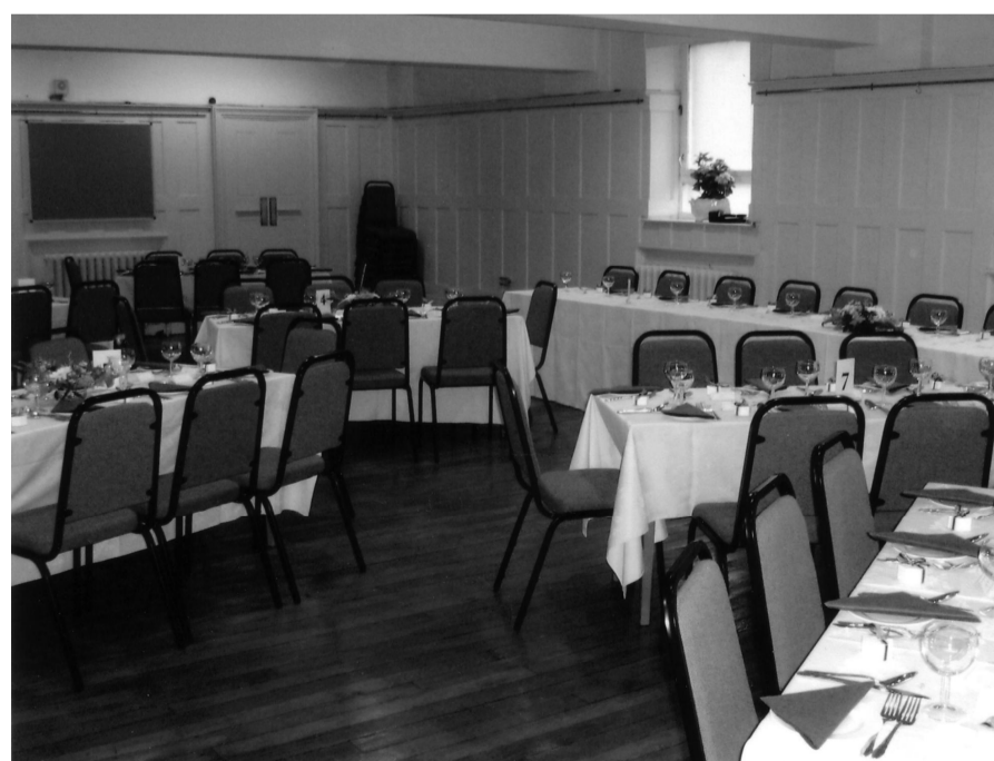
The Lily Montagu Hall dressed for a function.

To discuss your needs, contact the synagogue office on 020 8769 4787 or email office@southlondon.org