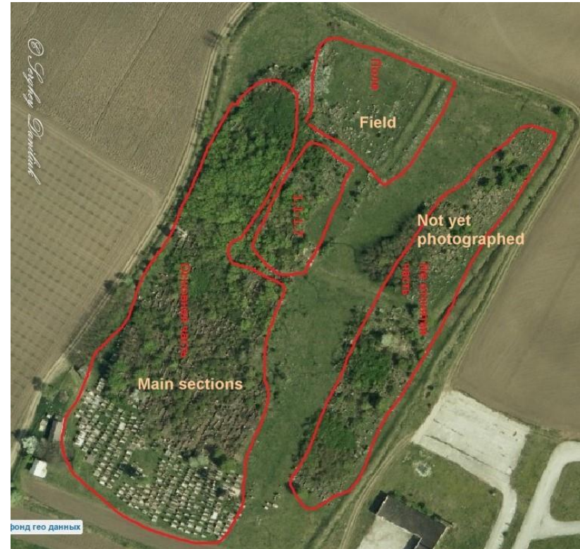
Map after first photographing at Brichany Jewish Cemetery

There are several other cemeteries we worked on should be cleared and all graves be photographed.