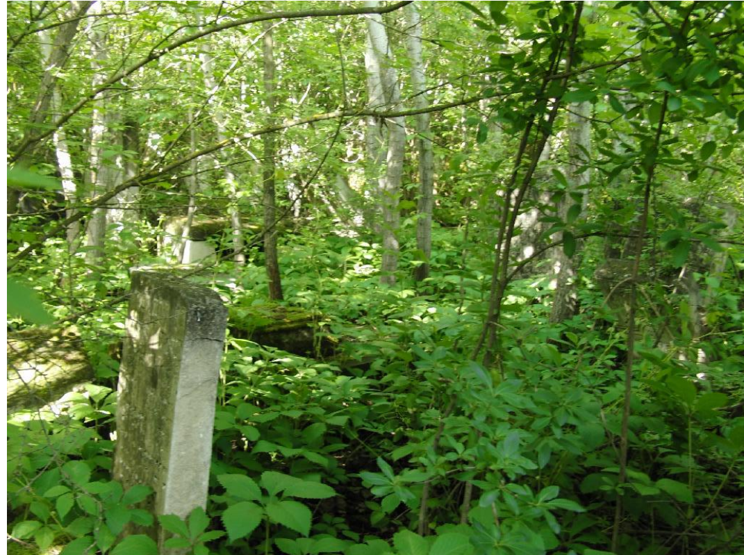
Here us a corner of a cemetery in Brichany