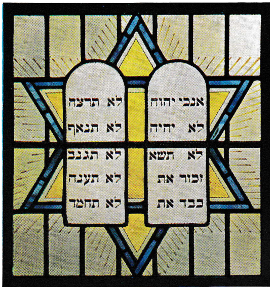
Tablets of the Law