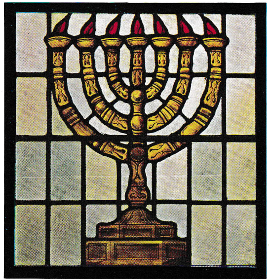
The Temple Menorah