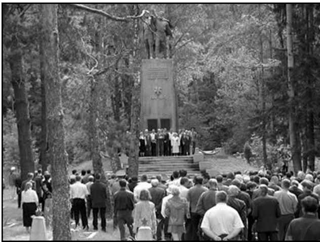
Fig. 4 - The Guta-Mikhalin monument to WWII victims

Retreating before the advance of the Red Army in the summer of 1944, the Germans burned down most of the houses in Ivatzevichi. They drove away to Germany for forced labor no less than a hundred Belorussians, Russians, and Poles. In the Ivatzevichi area, they burned down twenty-six villages: Bobrovichi, Borki, Viada, Zatishye, Zybaly, Krasnitza, Mikhalin, Omelnaya, Tupichitzy, Khodoki, among others. Five of these villages were never rebuilt. 16 After the war, a monument, Guta-Mikhalin, was built over a mass grave, and a cemetery established for peaceful citizens, Soviet warriors, and partisans. 17