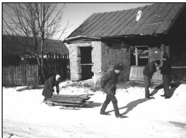
Fig. 8 - Ivatzevichi in winter, 2006