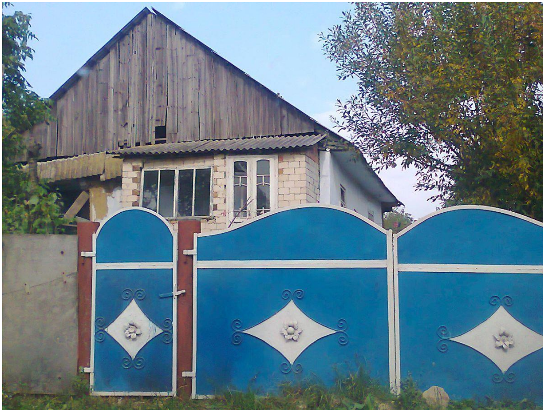
Former Klishkivtsi synagogue, 2014, from https://en.wikipedia.org/wiki/Klishkivtsi

The website and document has a lot of information on History of the area, Jewish presence, Holocaust, Family stories, photos.